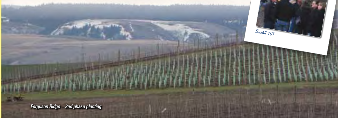
Ferguson Ridge – 2nd phase planting