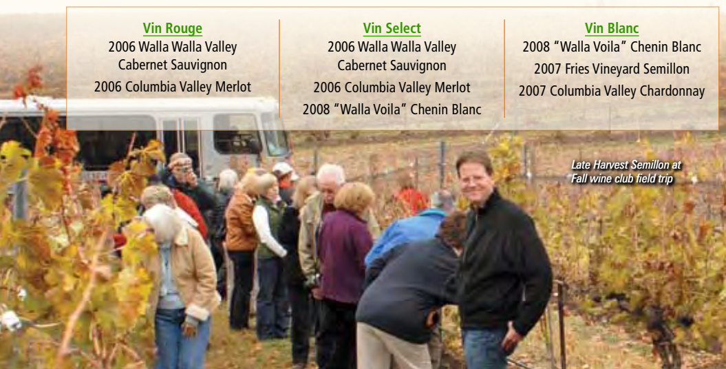
Late Harvest Semillon at Fall wine club field trip